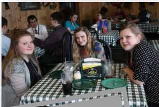
Shoshone Falls drops 52 feet further than Niagara Falls