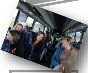
4-H is offered in every county in Idaho.