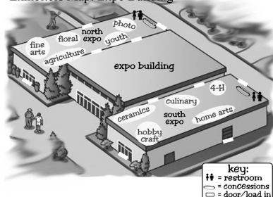
Exhibitors Map: Expo Building