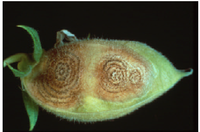
Figure 2. Pod infections by A. rabiei lead to infections of the seed. Note the concentric pattern in which the fruiting bodies emerge.