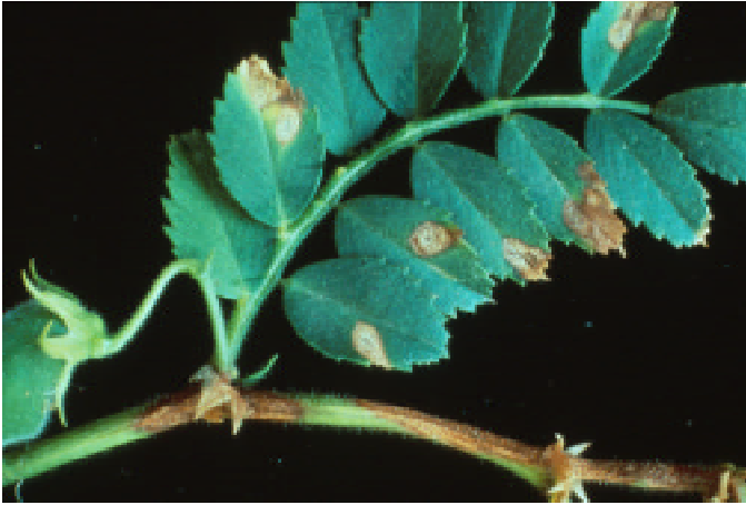
Figure 1. Typical symptoms of Ascochyta blight on chickpea leaves and stems. Note the small, dark, raised fruiting bodies of A. rabiei within the dry, necrotic lesions.