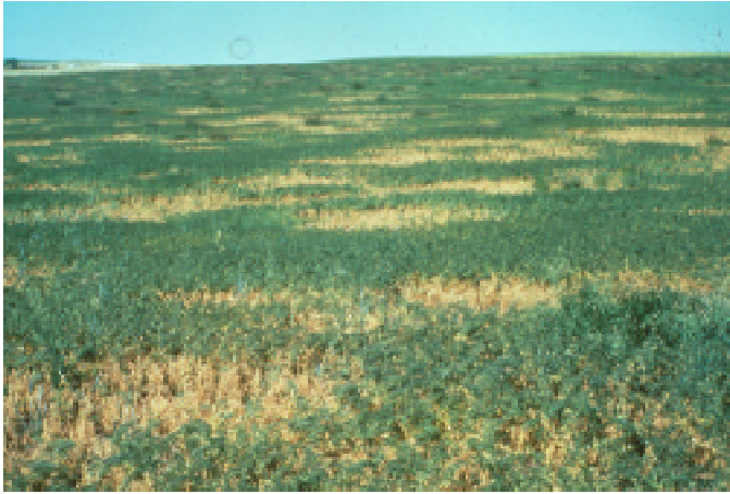
Figure 3. A chickpea field severely damaged by Ascochyta blight has a nonuniform canopy and patches of blight development.