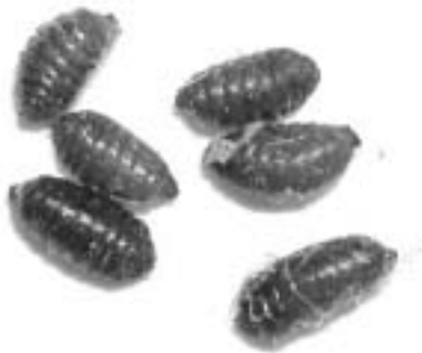
Fig. 4. Corn blotch leafminer ( Agromyza parvicornis ) pupae