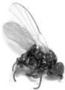
Fig. 2. Corn blotch leafminer ( Agromyza parvicornis ) adult

A new corn pest, the corn blotch leafminer ( Agromyza parvicornis ), was discovered in July 2002 in a northeastern Idaho field near Rigby. According to all available information, this was the pest's first occurrence in Idaho, although it has been reported previously in Southeastern and Midwestern states and, in 1995, in Nebraska. The current scientific literature indicates that corn is its only known host plant.