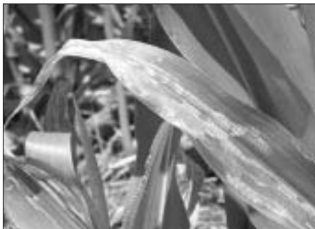
Fig. 1a and b. Blotch mines produced by Agromyza parvicornis on leaves of corn plants