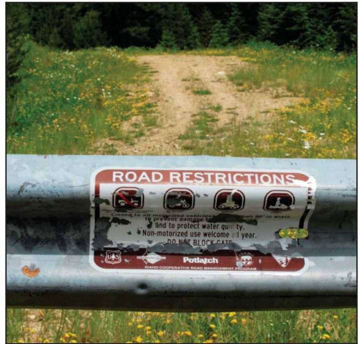
Forest road maintenance is of critical importance.

Long-term inactive forest roads are those not intended to be used in the near future, but will likely be used again in the distant future. Long-term inactive roads should be left in a condition to control erosion, and blocked to vehicular traffic. The Idaho Department of Lands may require you to remove bridges, culverts,