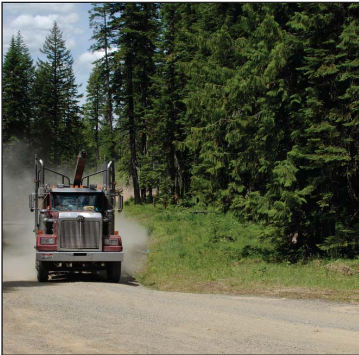
Forest road systems are one of the most important and costly part of a forest operation.