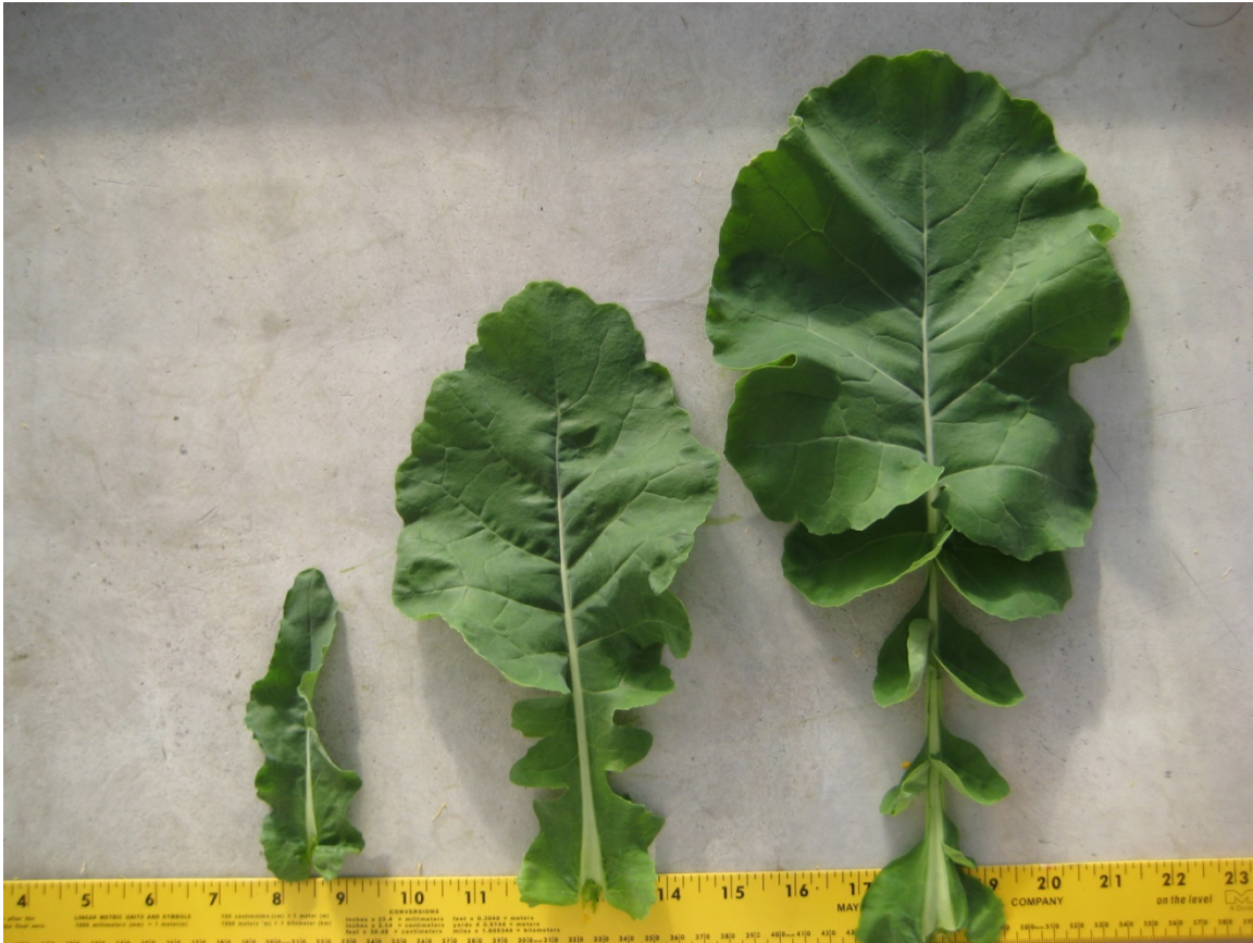
Figure D1. Lower, middle and upper leaves of Gem spring rapeseed.