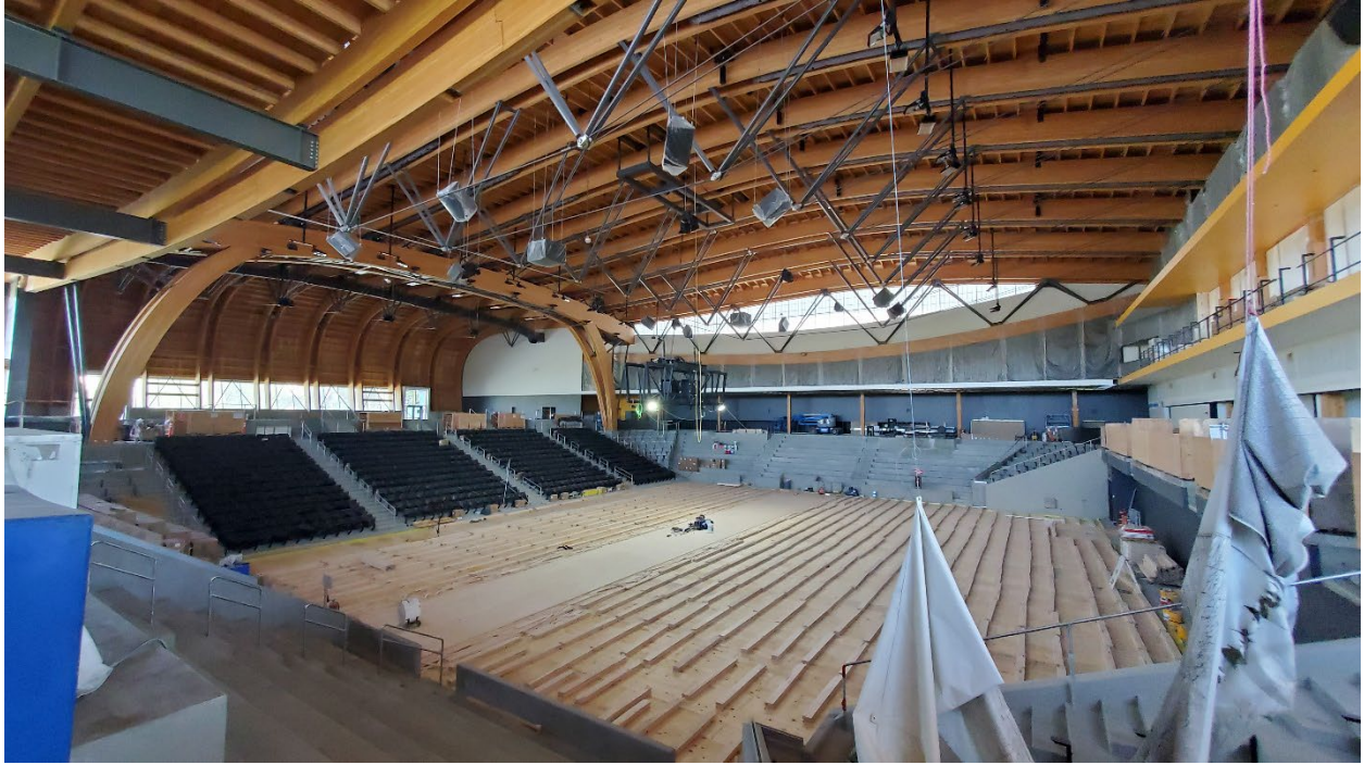
Figure 4 Arena Interior May 2021