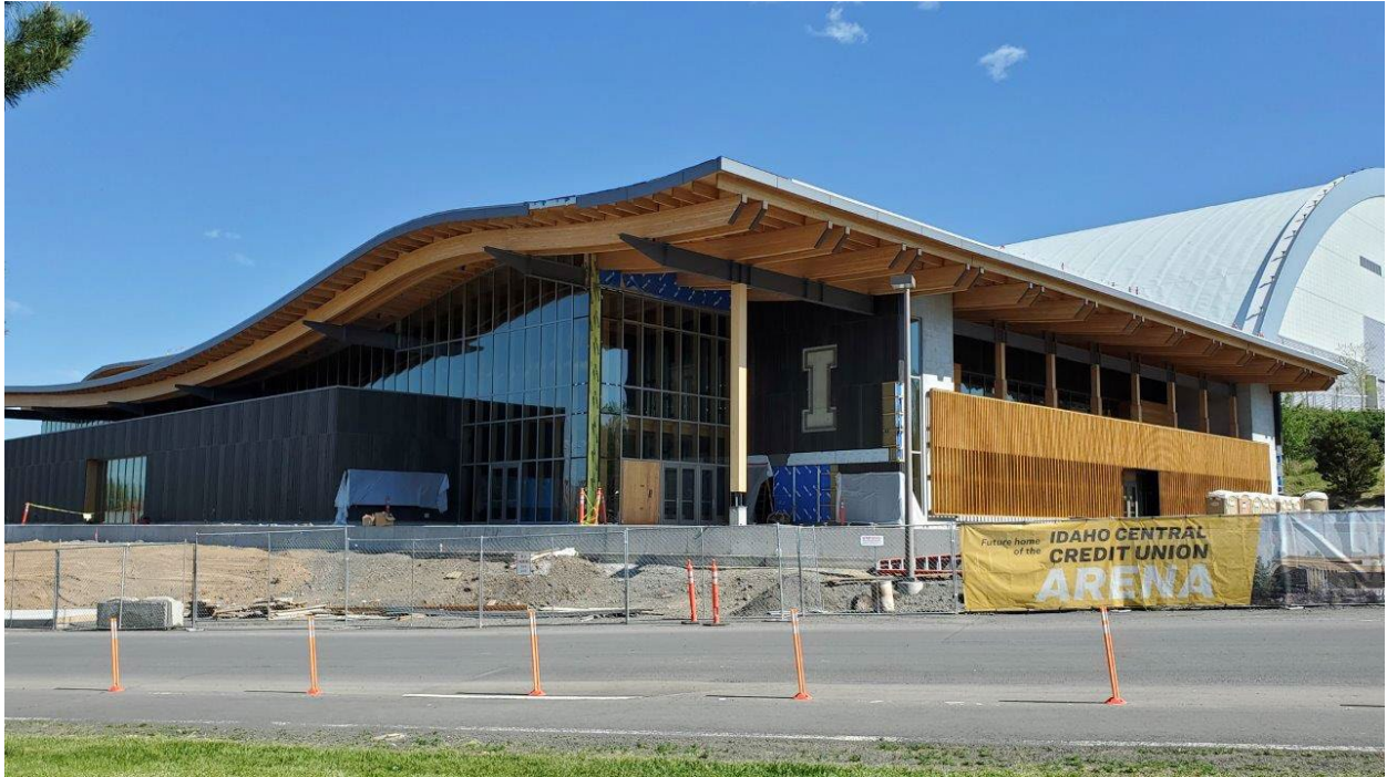
Figure 2 Northwest corner May 2021