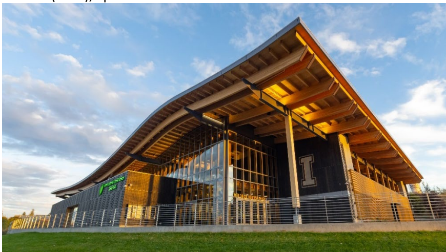
Figure 1 Completed building 2022

2022, International Interior Design Association (IIDA), Gateway Chapter, Interior Design Excellence Awards (IDEA), Sports & Recreation Winner.