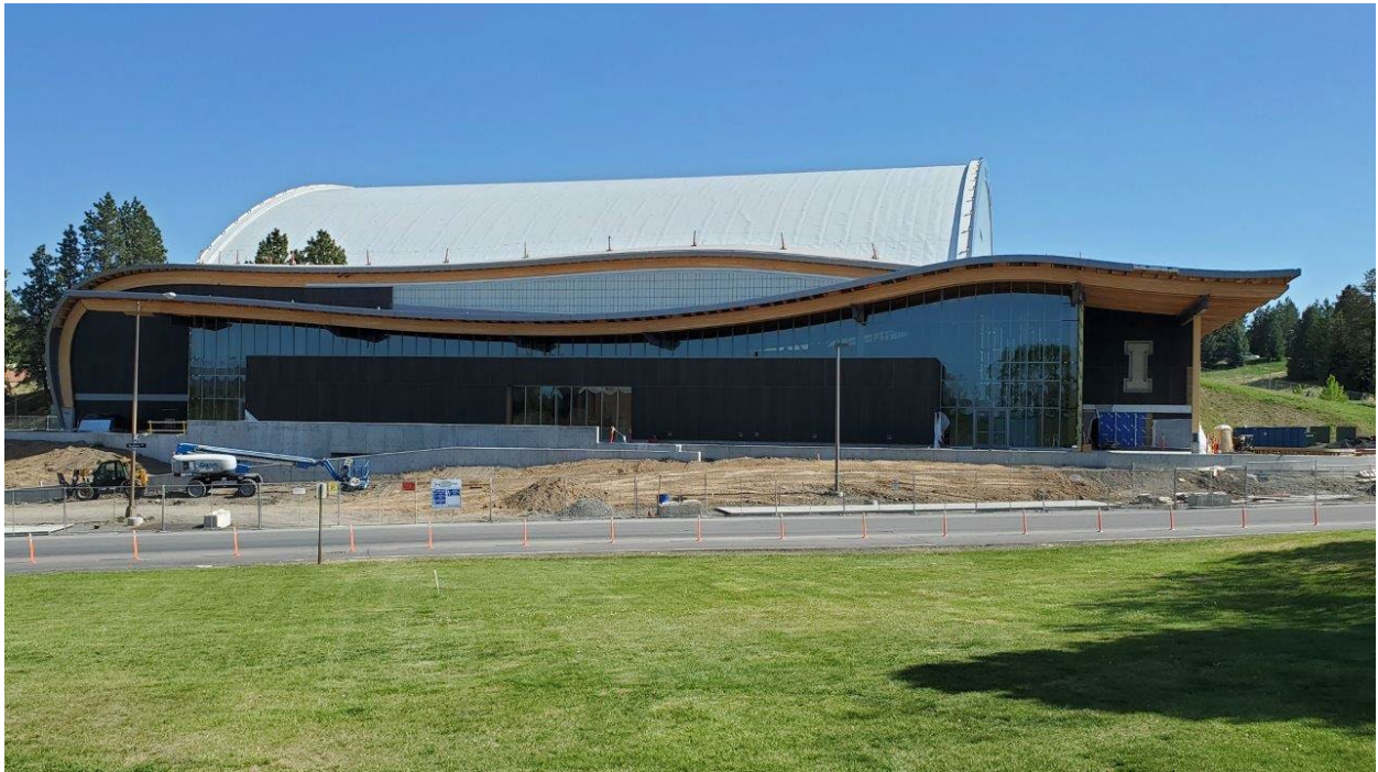
Figure 3 North Elevation May 2021