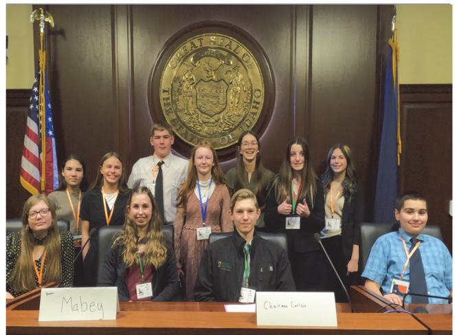
Delegates debated a bill presented by one of the steering committee youth in a hearing room of Idaho's State Capitol.

Idaho's 4-H Thriving Model gives youth the opportunity to explore their Sparks, alongside supportive peers and adults, and fosters a sense of belonging. Those foundational factors drive Thriving and Positive Youth Development (PYD) outcomes like social competence, positive academic attitude, personal responsibility, personal standards, contribution and connection with others. The 4-H Know Your Government Conference has been providing PYD opportunities for teens in eighth to 10th grade for 36 years. This year 120 youth participated from 23 of Idaho's 44 counties. The Know Your Government (KYG) Conference is planned and implemented using positive youth devel-