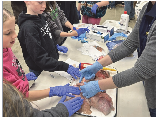
Youth palpate and inflate calf lungs to learn about the respiratory system at Youth Swine Field Day.

Sheep/Goat — halter making, equipment and breeds, cuts and cookery, wool judging, dairy products, hoof trimming, flight zone.