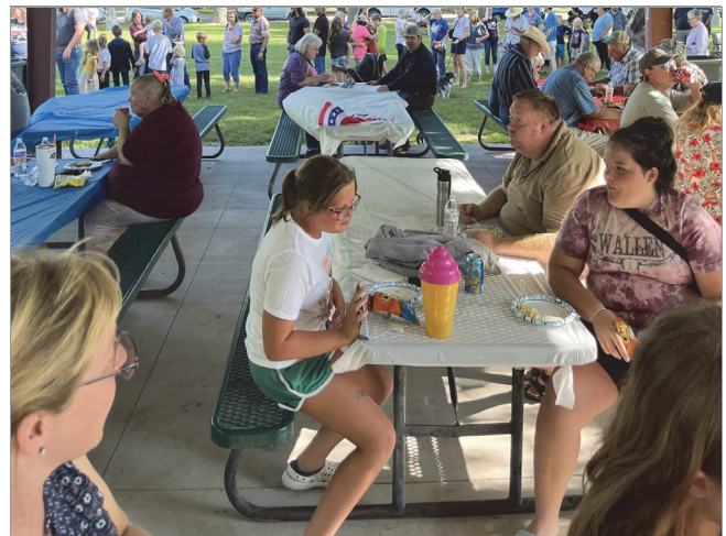
Wendell community barbecue.

The University of Idaho Extension Farm Stress Management Team met with 17 rural communities across Idaho. UI Extension educators coached interested residents through conversations about how their communities were dealing with mental health issues and