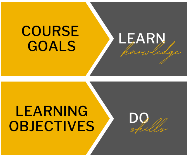
Figure 1. The differences between course goals (knowledge attained) and learning objectives (acquired skills).