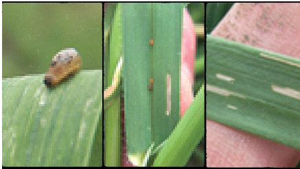
Cereal Leaf Beetles & Damage